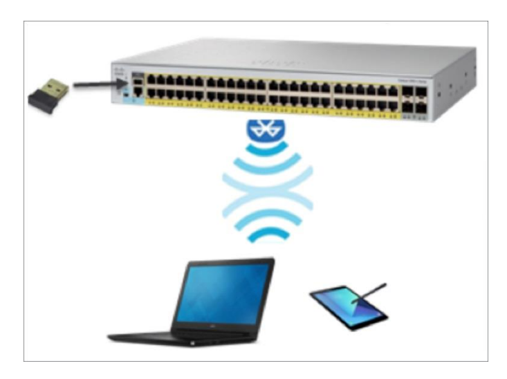
Figure 2. Over-the-air switch access using Bluetooth

• Virtual Stacking for managing a group of switches as a single entity. Up to eight switches can be configured and managed using a single IP address. Switches in a virtual stack can be configured from a single switch, which is called the commander switch. All the switches in a virtual stack can be managed using the CLI, SNMP, or the web UI. Switches in the virtual stack can also be configured and managed over the air via Bluetooth from a commander switch using the web UI. Virtual stacking also offers redundancy wherein a standby commander can manage and configure the stack if the primary master fails (Figure 3).